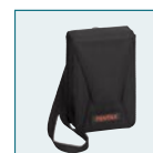
Code No. 50212 Nylon Case NC-E2