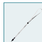
Code No. 39270 Sports Strap O-ST30