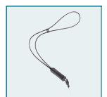
Code No. 39263 Leather Strap O-ST24